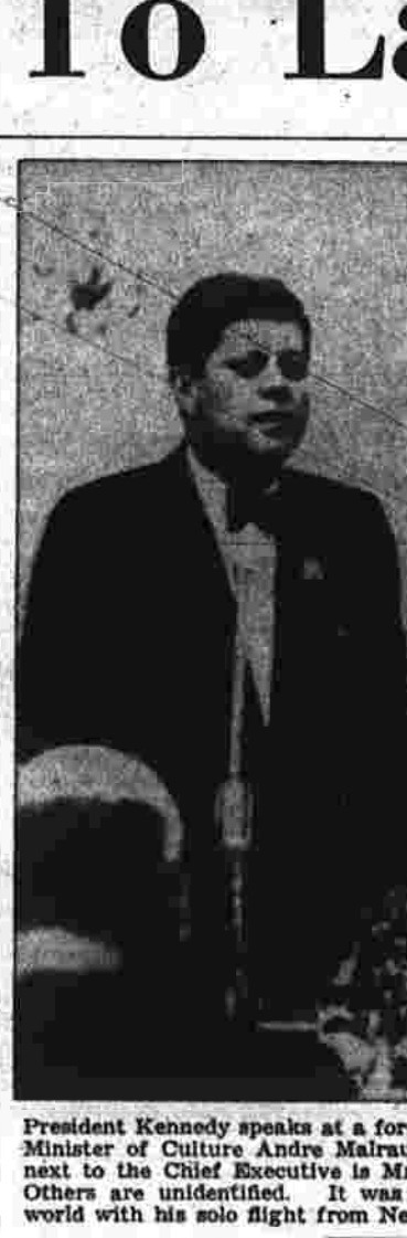
President Kennedy speaks at a formal dinner in the White House last night honoring visiting French Minister of Culture Andre Malraux.

By REFERRING F. GREEN HOT SPRINGS, Va. (AP)—President Kennedy and Attorney General Blough today set a national example by voluntarily disclosing their own tax returns.