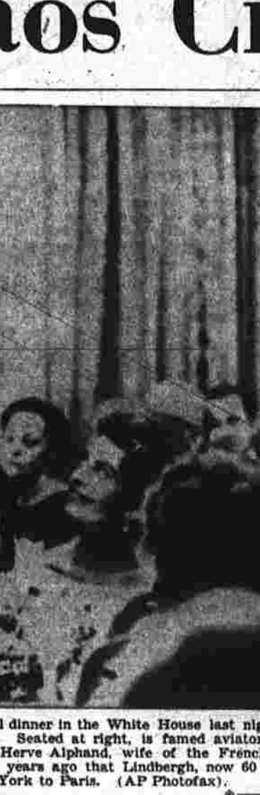
President Kennedy speaks at a formal dinner in the White House last night honoring visiting French Minister of Culture Andre Malraux.