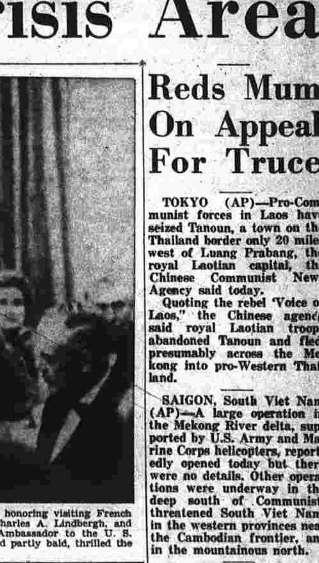
President Kennedy speaks at a formal dinner in the White House last night honoring visiting French Minister of Culture Andre Malraux.